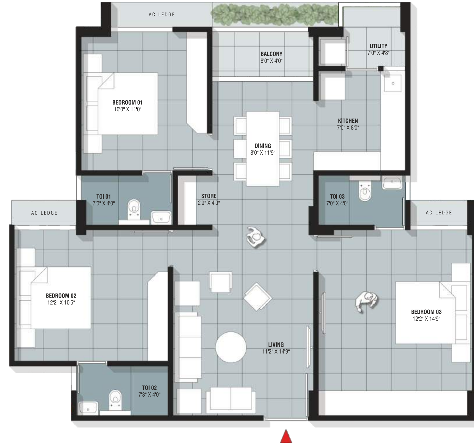
TYPE-E | 3 BHK+3T