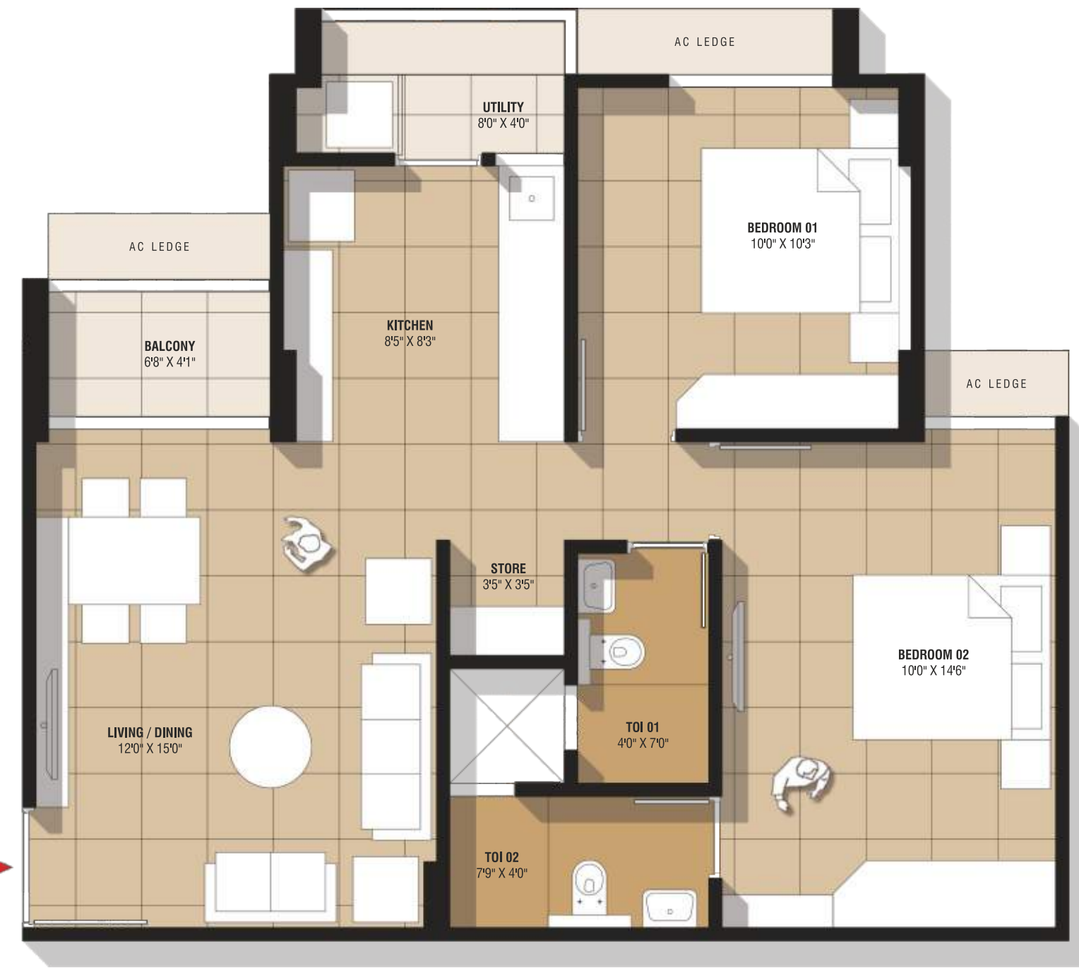
TYPE-B | 2 BHK+2T