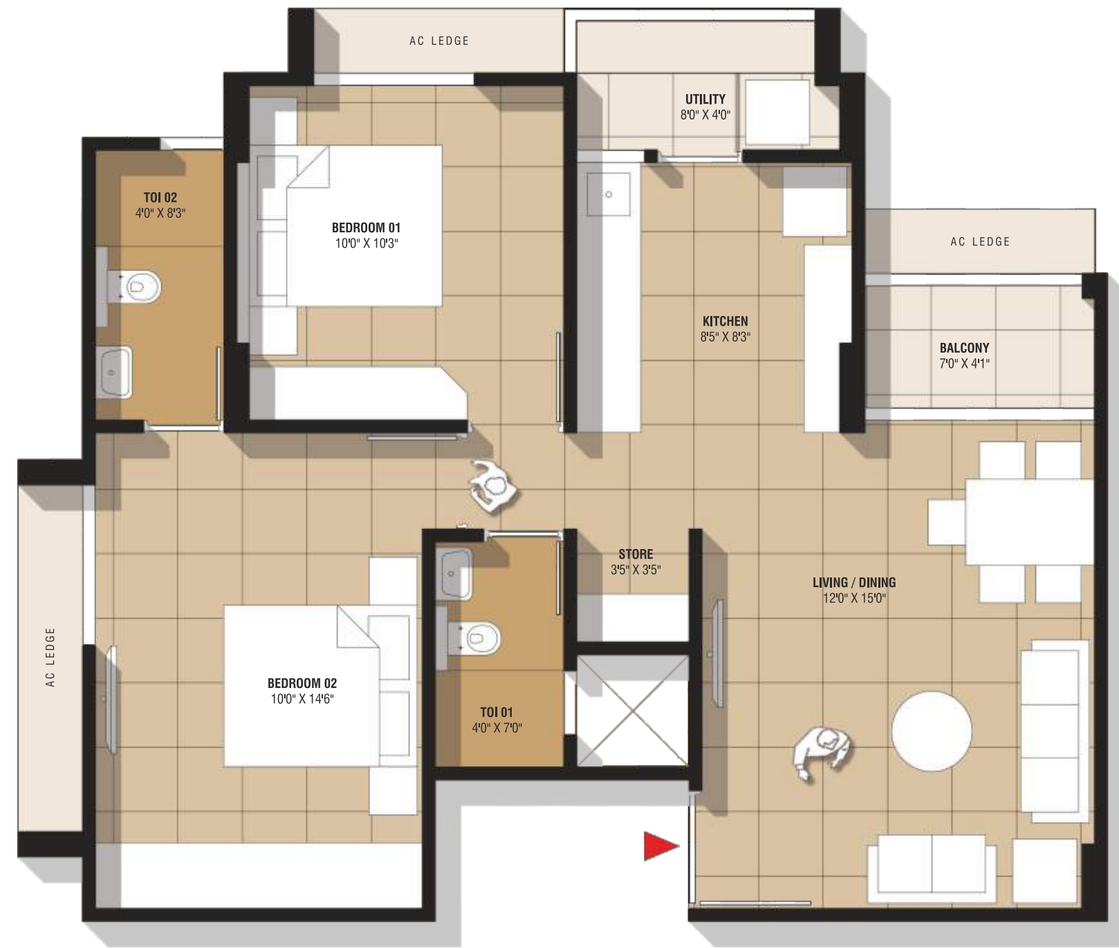
TYPE-A | 2 BHK+2T